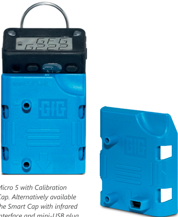
Micro 5 with Calibration Cap. Alternatively available the Smart Cap with infrared interface and mini-USB plug.

* Sensor can also be set to other measuring ranges (refer to sensor specification)