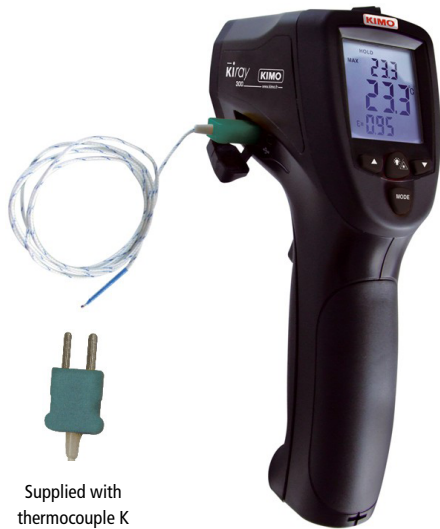
Supplied with thermocouple K probe

Infrared thermometer Kiray 300 is a thermometer used to diagnose, inspect and check any temperature. Thanks to its elaborated optical system with a dual laser sighting, it allows easy and accurate measurements of little distant targets. The KIRAY 300 instrument has an internal memory which can save up to 100 measurements. Compatible with thermocouple K probe.