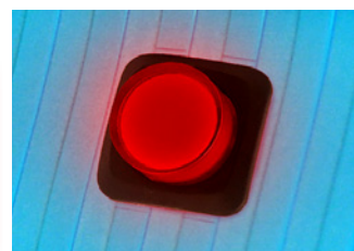
Push button manual alarm