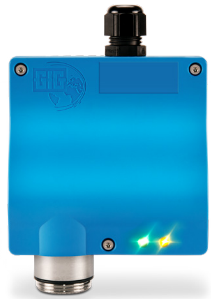
ZD22 D transmitter with one cable entry for analog connection

In combination with GfG's powerful controllers, both variants are the right choice for long-term oxygen monitoring.