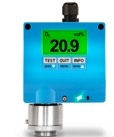
Analog version of the EC22 O with one cable entry and display

The compact housing for wall mounting is protected against splash water and dust (IP54). The front of the EC22 O features a 2.2-inch color backlit display, three push buttons for service and operation, and two status LEDs.