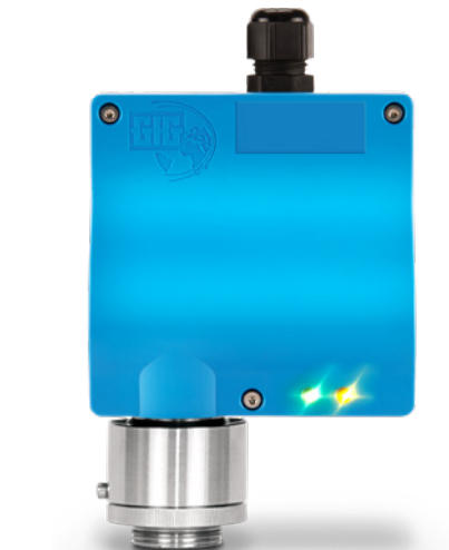
Analog version of the EC22 O with one cable entry

The compact housing for wall mounting is protected against splash water and dust (IP54). There are two status LEDs on the front of the EC22 O. The green one indicates operational readiness, the yellow one signals faults or special states.