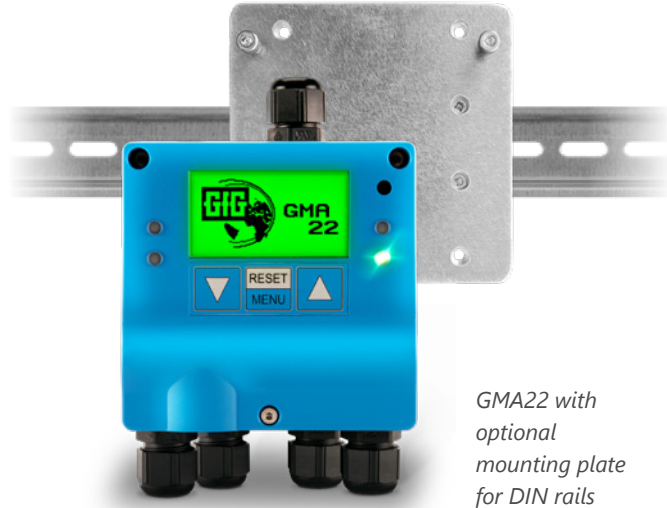
GMA22 with optional mounting plate for DIN rails

Even more flexibility results from the option to address not only the transmitters but also up to 4 additional relay modules of type GMA200-RT or GMA200-RTD via the digital RS485 interface.